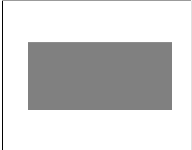
Fig.5 The SP1648 operating in the voltage-controlled mode

C_S = shunt capacitance (input plus external capacitance).